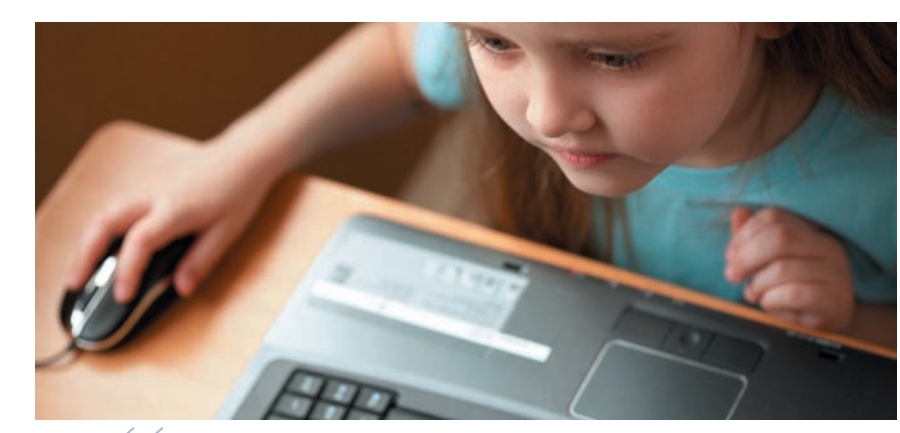
66 ...technology can have a strong impact on improving academic performance, particularly among children with lower grades.

• Educate and train people for 21st Century employment. Digital Inclusion